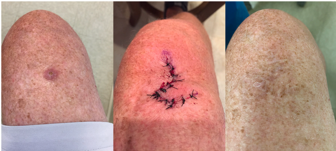
Fig. 2. A, B and C. Reconstruction of anterior thigh defect with rhomboid flap. A. Appearance of the cutaneous defect prior to excision. B. Appearance of the “broken” scar one day after excision. C. Appearance of the scar 1 year after excision. At one year, the scar is very well-matched and difficult to see.