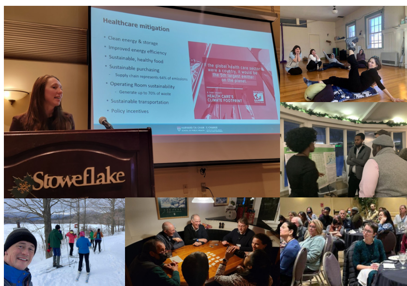
Photo collage from 43rd Annual NNE CO-OP PCBRN Meeting