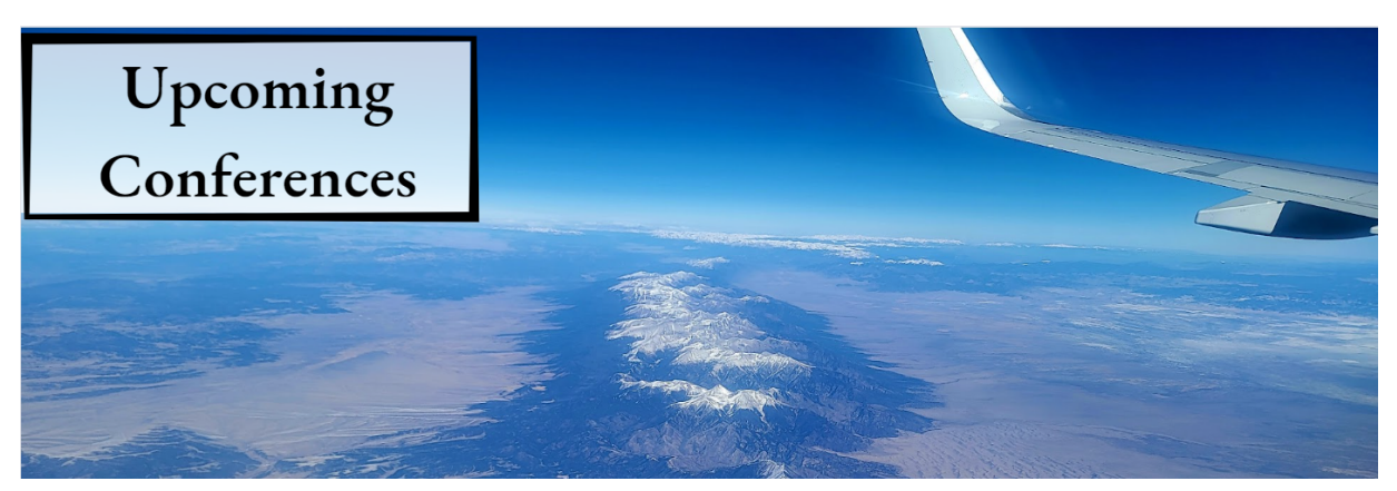
In the Air to NAPCRG 50th Annual Meeting

As our staff adjust to coming back last month from a successful presentation of projects at the 2022 NAPCRG Annual Meeting in Phoenix, Arizona, the CO-OP is gearing up for its 43rd Annual Meeting.