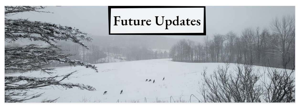
Wild Turkey Crossing Rural Vermont