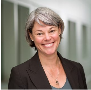
Director of The Dartmouth Institute for Health Policy and Clinical Practice (TDI)