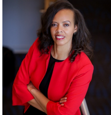
Dean of Faculty Affairs