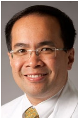
Interim Chair, Department of Pathology and Laboratory Medicine