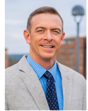
Chief of Staff