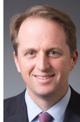
Interim Chair, Department of Orthopaedics