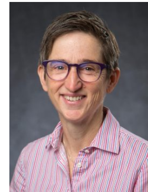
Chair, Department of Community and Family Medicine