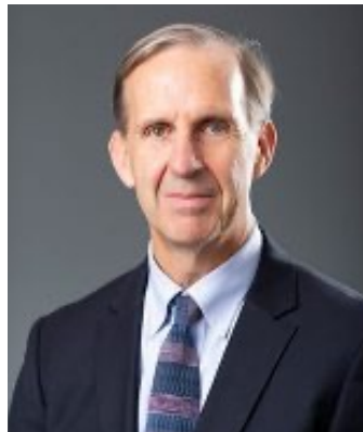
Interim Chair, Department of Psychiatry