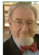
C. Everett Koop, MD

Tobacco use in the population has changed dramatically with many novel products entering the market in the past few years. Cigarettes remain the most commonly used product among adults - and the most deadly. In addition to potentially lower-harm tobacco products, like electronic cigarettes, we face more use of other combusted products like marijuana - especially in states where recreational use is legal. In the clinic or ambulatory setting, we struggle to deliver advice to the many constellations of tobacco and marijuana use. The Tenth Annual Koop Conference will embrace the complexity of these issues by addressing many different aspects of inhaled use of substances.