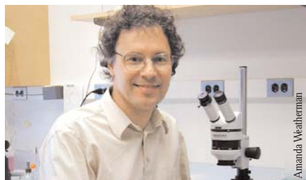
Victor Ambros, PhD

Geneticists at Dartmouth Medical School have discovered a new family of unusually small genes that act in the finely tuned yet remarkably versatile orchestration of development and behavior, adding still another dimension to the diversity and complexity of the cell.